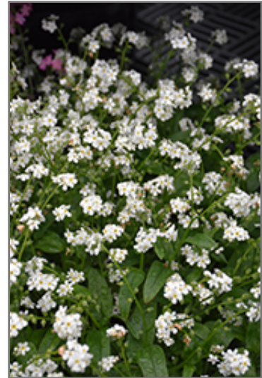
Victoria White Forget-Me-Not flowers