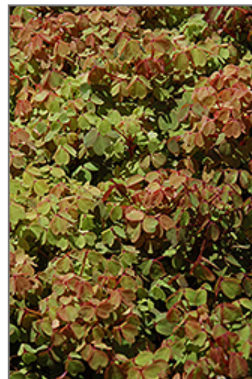
Sunset Velvet Shamrock foliage