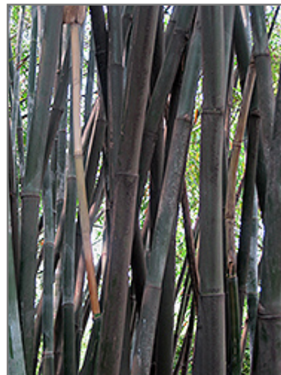
Chinese Goddess Bamboo bark

Chinese Goddess Bamboo is recommended for the following landscape applications;