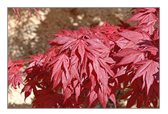
Oregon Sunset Japanese Maple foliage