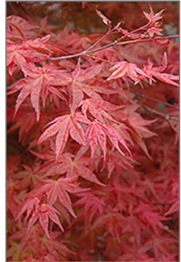
Suminagashi Japanese Maple foliage

This tree does best in full sun to partial shade. You may want to keep it away from hot, dry locations that receive direct afternoon sun or which get reflected sunlight, such as against the south side of a white wall. It prefers to grow in average to moist conditions, and shouldn't be allowed to dry out. It is not particular as to soil pH, but grows best in rich soils. It is somewhat tolerant of urban pollution, and will benefit from being planted in a relatively sheltered location. Consider applying a thick mulch around the root zone in winter to protect it in exposed locations or colder microclimates. This is a selected variety of a species not originally from North America.