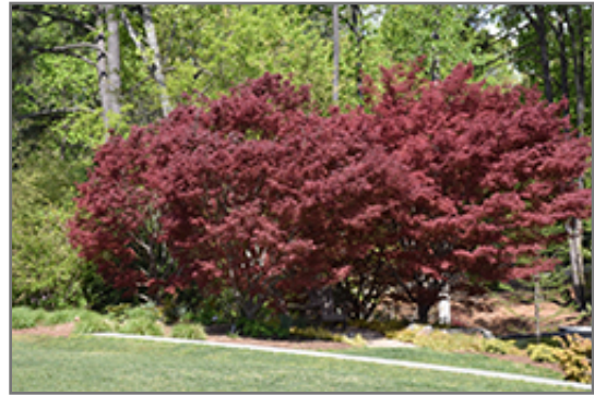
Suminagashi Japanese Maple