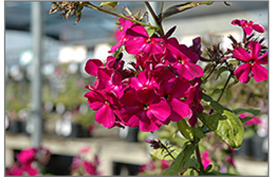
Red Magic Garden Phlox flowers