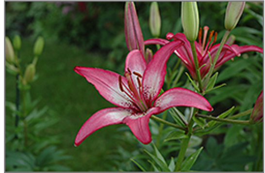
Sorbet Lily flowers

An eye-catching hardy lily that produces lovely large white blooms that are streaked with hot rose-pink, buttery yellow centers and black freckles; stunning as a garden focal point, this variety is perfect as a border planting or adorning planters