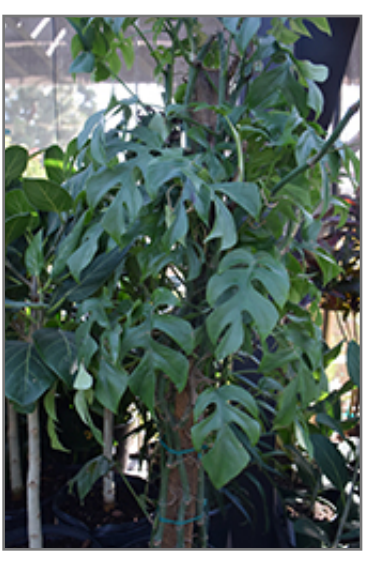
Mini Monstera

When grown indoors, Mini Monstera can be expected to grow to be about 12 feet tall at maturity, with a spread of 3 feet. It grows at a medium rate, and under ideal conditions can be expected to live for approximately 20 years. This houseplant performs well in both bright or indirect sunlight and strong artificial light, and can therefore be situated in almost any well-lit room or location. It is very adaptable to both dry and moist soil, but will not tolerate any standing water. The surface of the soil shouldn't be allowed to dry out completely, and so you should expect to water this plant once and possibly even twice each week. Be aware that your particular watering schedule may vary depending on its location in the room, the pot size, plant size and other conditions; if in doubt, ask one of our experts in the store for advice. It will benefit from a regular feeding with a general-purpose fertilizer with every second or third watering. It is not particular as to soil type or pH; an average potting soil should work just fine. Be warned that parts of this plant are known to be toxic to humans and animals, so special care should be exercised if growing it around children and pets.