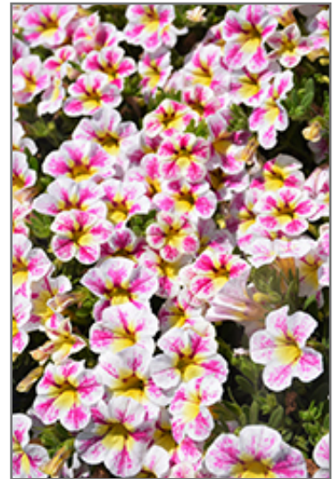
Superbells Holy Cow! Calibrachoa flowers

Superbells Holy Cow! Calibrachoa is a dense herbaceous annual with a trailing habit of growth, eventually spilling over the edges of hanging baskets and containers. Its medium texture blends into the garden, but can always be balanced by a couple of finer or coarser plants for an effective composition.