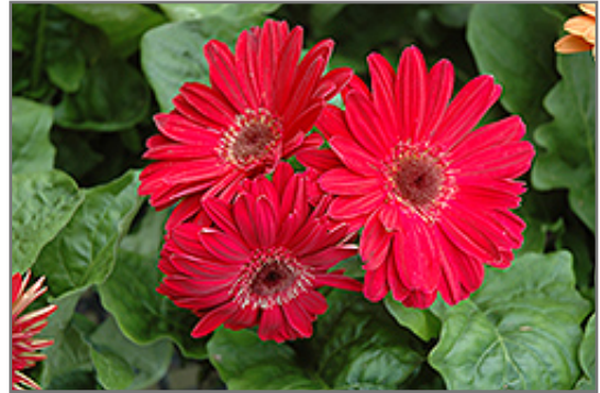
Fuchsia Gerbera Daisy flowers