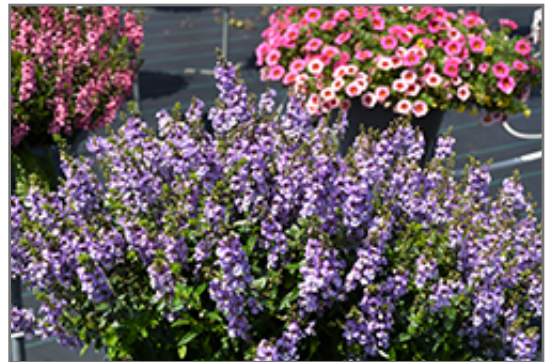
Serenita Sky Blue Angelonia in bloom