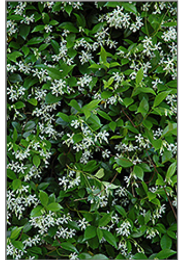
Confederate Star-Jasmine flowers