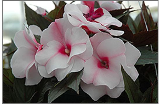
Paradise White Blush New Guinea Impatiens flowers