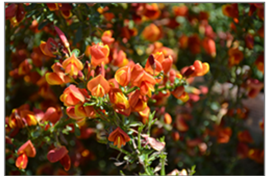
Lena Scotch Broom flowers