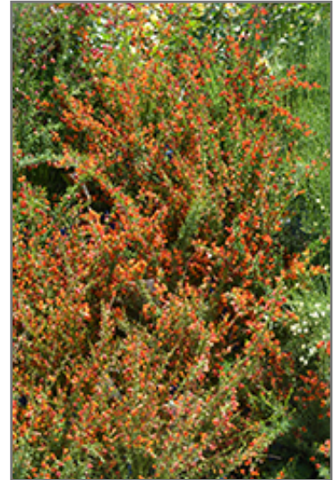
Lena Scotch Broom in bloom

This shrub should only be grown in full sunlight. It prefers dry to average moisture levels with very well-drained soil, and will often die in standing water. It is considered to be drought-tolerant, and thus makes an ideal choice for xeriscaping or the moisture-conserving landscape. It is particular about its soil conditions, with a strong preference for clay, alkaline soils, and is able to handle environmental salt. It is highly tolerant of urban pollution and will even thrive in inner city environments. This particular variety is an interspecific hybrid.