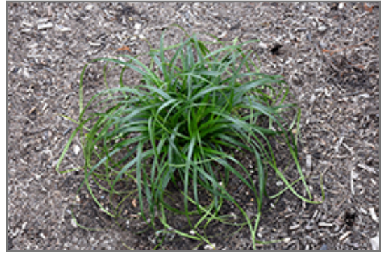
Ribbon Falls Sedge