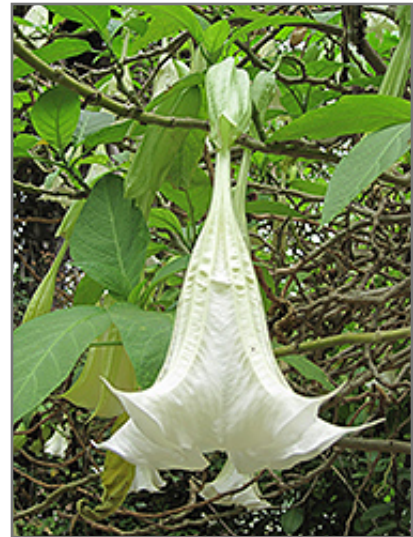
Betty Marshall Angel's Trumpet flowers

When grown indoors, Betty Marshall Angel's Trumpet can be expected to grow to be about 8 feet tall at maturity, with a spread of 6 feet. It grows at a fast rate, and under ideal conditions can be expected to live for approximately 30 years. This houseplant will do well in a location that gets either direct or indirect sunlight, although it will usually require a more brightly-lit environment than what artificial indoor lighting alone can provide. It does best in average to evenly moist soil, but will not tolerate standing water. The surface of the soil shouldn't be allowed to dry out completely, and so you should expect to water this plant once and possibly even twice each week. Be aware that your particular watering schedule may vary depending on its location in the room, the pot size, plant size and other conditions; if in doubt, ask one of our experts in the store for advice. It is not particular as to soil type or pH; an average potting soil should work just fine. Be warned that parts of this plant are known to be toxic to humans and animals, so special care should be exercised if growing it around children and pets.