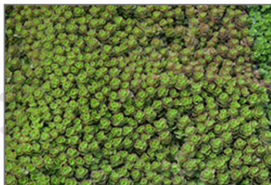
Dragon's Blood Stonecrop foliage