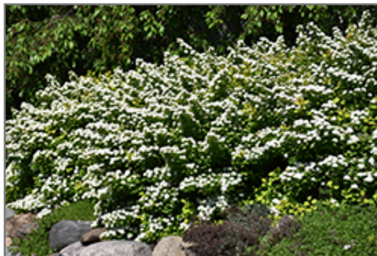
Glow Girl Birchleaf Spirea in bloom

Glow Girl Birchleaf Spirea is recommended for the following landscape applications;