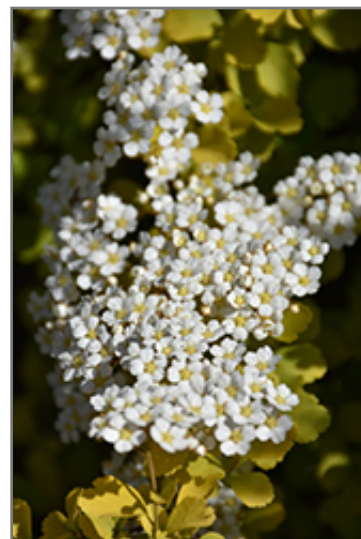
Glow Girl Birchleaf Spirea flowers