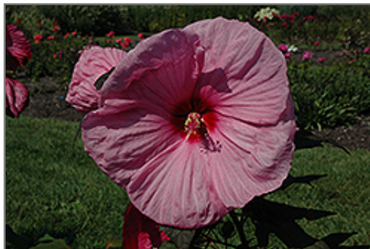
Dave Fleming Hibiscus flowers

Other Names: Rose Mallow, Hardy Hibiscus