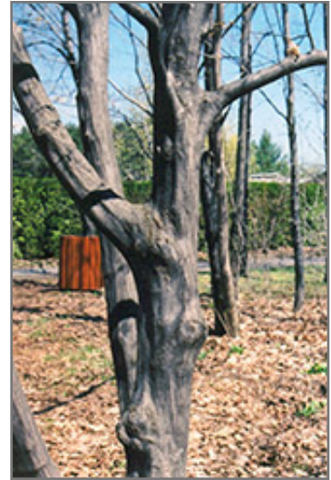
Blue Beech bark

This tree performs well in both full sun and full shade. It is an amazingly adaptable plant, tolerating both dry conditions and even some standing water. It is not particular as to soil type or pH. It is somewhat tolerant of urban pollution. This species is native to parts of North America.