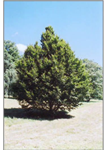
Blue Beech

The Blue Beech is recommended for the following landscape applications;