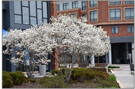
Autumn Brilliance Serviceberry Clump in bloom

Autumn Brilliance Serviceberry Clump is recommended for the following landscape applications;