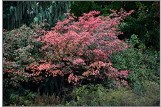
Autumn Brilliance Serviceberry Clump in fall

This tree does best in full sun to partial shade. It prefers to grow in average to moist conditions, and shouldn't be allowed to dry out. It is not particular as to soil type or pH. It is somewhat tolerant of urban pollution. This particular variety is an interspecific hybrid.