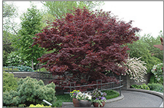
Bloodgood Japanese Maple

Bloodgood Japanese Maple is recommended for the following landscape applications;