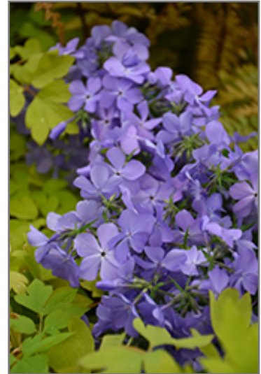
Blue Moon Phlox flowers