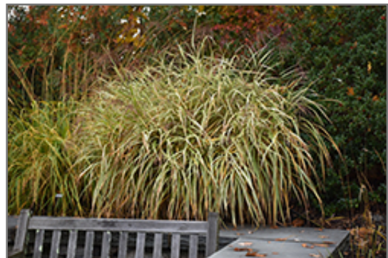
Dixieland Maiden Grass in fall