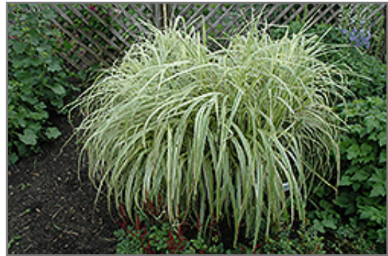
Dixieland Maiden Grass flowers