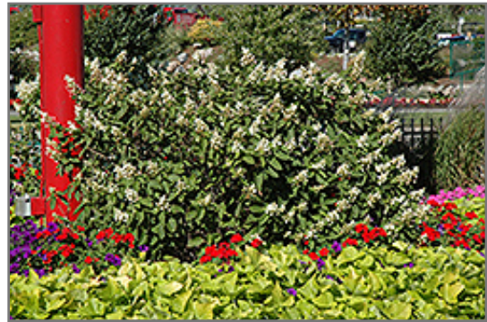
Compact Pee Gee Hydrangea in bloom