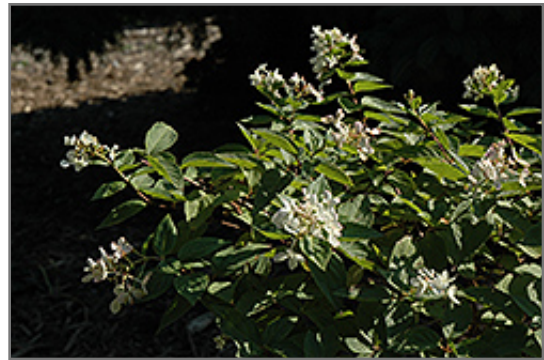
Compact Pee Gee Hydrangea flowers