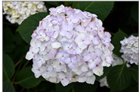
Blushing Bride Hydrangea flowers