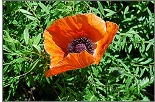
Oriental Poppy flowers

Oriental Poppy will grow to be about 24 inches tall at maturity, with a spread of 24 inches. When grown in masses or used as a bedding plant, individual plants should be spaced approximately 18 inches apart. It grows at a fast rate, and under ideal conditions can be expected to live for approximately 5 years. As an herbaceous perennial, this plant will usually die back to the crown each winter, and will regrow from the base each spring. Be careful not to disturb the crown in late winter when it may not be readily seen! As this plant tends to go dormant in summer, it is best interplanted with late-season bloomers to hide the dying foliage.