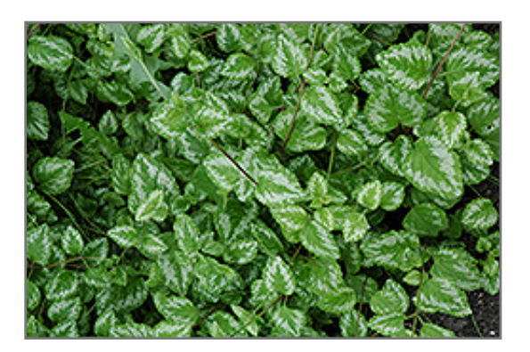
Variegatum Yellow Archangel foliage

Variegatum Yellow Archangel will grow to be about 12 inches tall at maturity, with a spread of 3 feet. It grows at a fast rate, and under ideal conditions can be expected to live for approximately 10 years. As an herbaceous perennial, this plant will usually die back to the crown each winter, and will regrow from the base each spring. Be careful not to disturb the crown in late winter when it may not be readily seen!