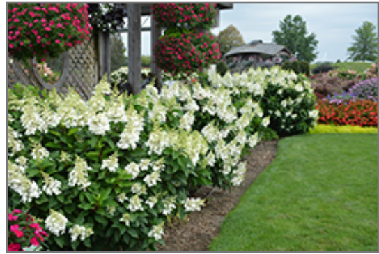
Fire Light Hydrangea in bloom

Fire Light Hydrangea makes a fine choice for the outdoor landscape, but it is also well-suited for use in outdoor pots and containers. With its upright habit of growth, it is best suited for use as a 'thriller' in the 'spiller-thriller-filler' container combination; plant it near the center of the pot, surrounded by smaller plants and those that spill over the edges. It is even sizeable enough that it can be grown alone in a suitable container. Note that when grown in a container, it may not perform exactly as indicated on the tag - this is to be expected. Also note that when growing plants in outdoor containers and baskets, they may require more frequent waterings than they would in the yard or garden.