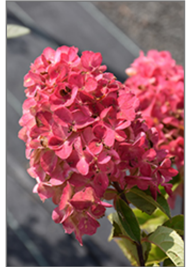
Fire Light Hydrangea flowers