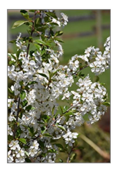
Juliet Cherry flowers