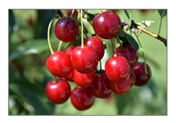
Juliet Cherry fruit

Juliet Cherry features showy clusters of fragrant white flowers along the branches in mid spring. It has green deciduous foliage. The glossy oval leaves turn yellow in fall. The fruits are showy dark red drupes carried in abundance from mid to late summer.