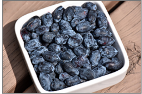
Boreal Beast Honeyberry fruit

This is a dense multi-stemmed deciduous shrub with a more or less rounded form. Its average texture blends into the landscape, but can be balanced by one or two finer or coarser trees or shrubs for an effective composition. This plant will require occasional maintenance and upkeep, and is best pruned in late winter once the threat of extreme cold has passed. It is a good choice for attracting butterflies to your yard. It has no significant negative characteristics.