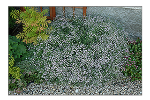
Common Baby's Breath in bloom