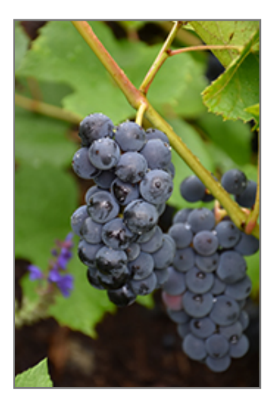
Beta Grape fruit

phone: 780-472-6260 • web: www.arrowheadnurseries.com