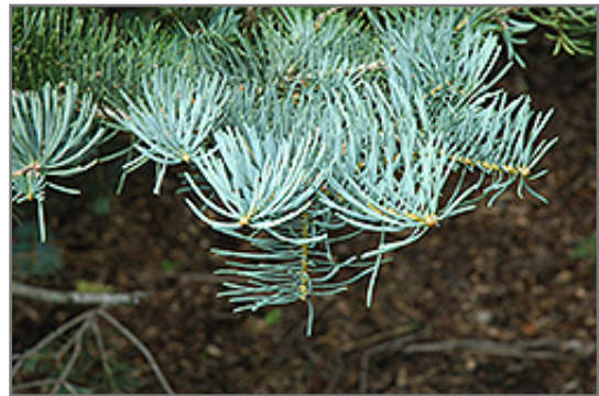
White Fir foliage