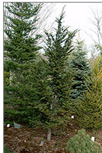
Burkett's Dwarf Hemlock

Burkett's Dwarf Hemlock will grow to be about 7 feet tall at maturity, with a spread of 3 feet. It tends to fill out right to the ground and therefore doesn't necessarily require facer plants in front, and is suitable for planting under power lines. It grows at a slow rate, and under ideal conditions can be expected to live for 50 years or more.