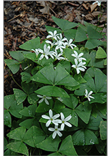
Irish Mist Shamrock flowers

Rich green foliage with white spots during cooler weather; dotted with dainty white flowers rising up in spring; interesting foliage opens and closes throughout the day; pair this up with contrasting colors for big impact