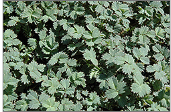
Blue Haze New Zealand Burr foliage

This is a lovely ornamental plant that forms a low mat of steel blue ferny foliage; likes moisture but will tolerate short dry periods; perfect for adding interest to border fronts and planters