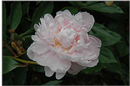
Pride of Essex Peony flowers