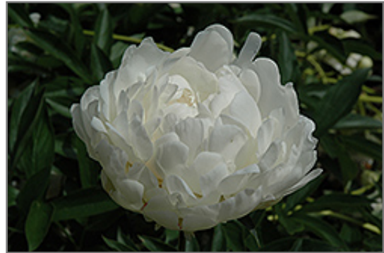
Emile Lemoine Peony flowers