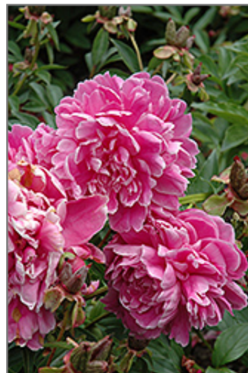
Lamartine Peony flowers