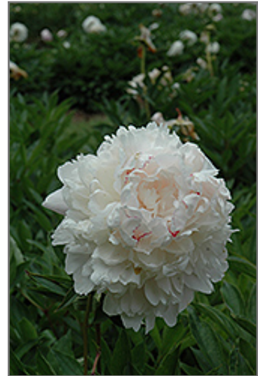
Chestine Gowdy Peony flowers