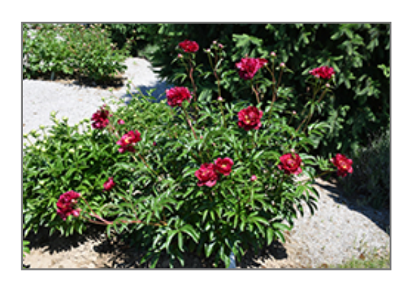
Cherry Hill Peony in bloom