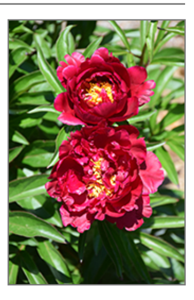
Cherry Hill Peony flowers