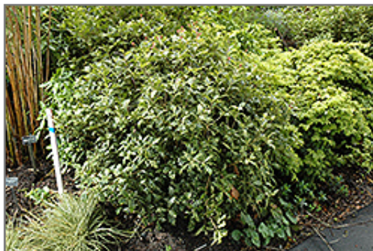
Variegated False Holly