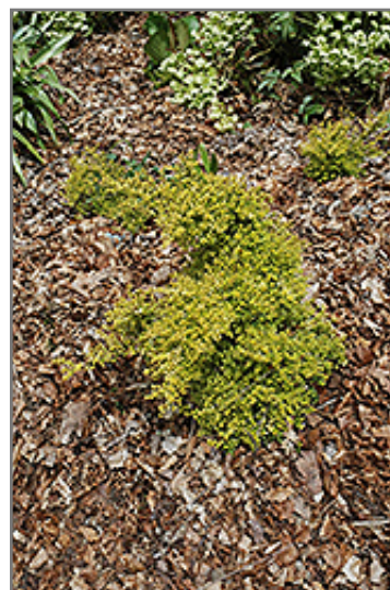
Baggesen's Gold Box Honeysuckle