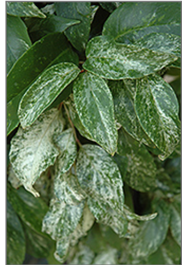
Chirimen Kadsura Vine foliage

Chirimen Kadsura Vine will grow to be about 15 feet tall at maturity, with a spread of 4 feet. As a climbing vine, it tends to be leggy near the base and should be underplanted with low-growing facer plants. It should be planted near a fence, trellis or other landscape structure where it can be trained to grow upwards on it, or allowed to trail off a retaining wall or slope. It grows at a fast rate, and under ideal conditions can be expected to live for approximately 20 years.