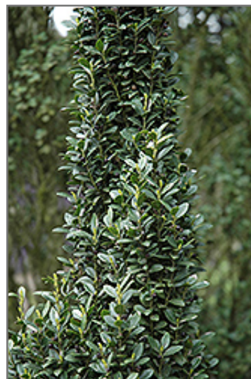
Sky Sentry Japanese Holly foliage