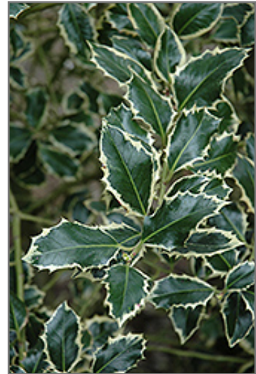
Dr. Davis Holly foliage