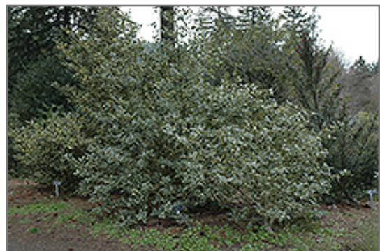
Dr. Davis Holly