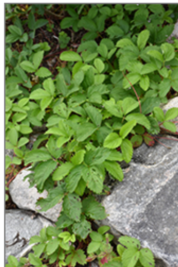
Common Wild Strawberry

Common Wild Strawberry is a good choice for the edible garden, but it is also well-suited for use in outdoor pots and containers. Because of its spreading habit of growth, it is ideally suited for use as a 'spiller' in the 'spiller-thriller-filler' container combination; plant it near the edges where it can spill gracefully over the pot. Note that when growing plants in outdoor containers and baskets, they may require more frequent waterings than they would in the yard or garden. Be aware that in our climate, most plants cannot be expected to survive the winter if left in containers outdoors, and this plant is no exception. Contact our experts for more information on how to protect it over the winter months.