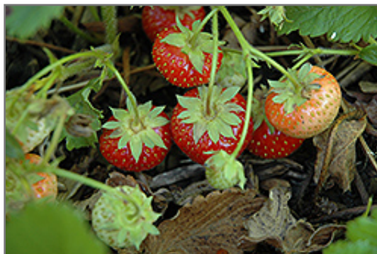
Common Wild Strawberry

Common Wild Strawberry features dainty white cup-shaped flowers with yellow eyes along the stems from late spring to early summer. Its attractive tomentose round compound leaves remain green in colour throughout the season. It features an abundance of magnificent cherry red berries from late spring to late summer.