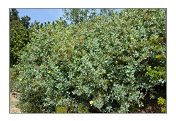
Island Bush Poppy

This is a relatively low maintenance shrub, and should only be pruned after flowering to avoid removing any of the current season's flowers. It has no significant negative characteristics.