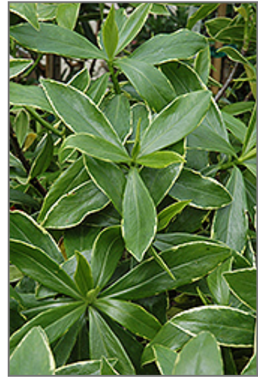
Winter Daphne foliage

Winter Daphne will grow to be about 5 feet tall at maturity, with a spread of 5 feet. It tends to fill out right to the ground and therefore doesn't necessarily require facer plants in front, and is suitable for planting under power lines. It grows at a slow rate, and under ideal conditions can be expected to live for approximately 20 years.